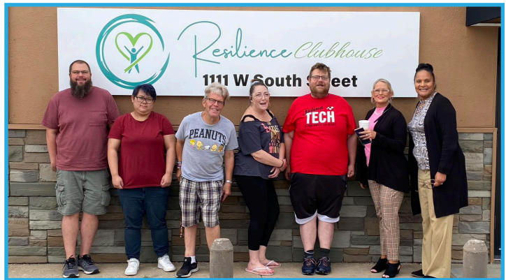
Resilience Clubhouse Members in front of their new building purchased for them by an anonymous donor.

These grants were funded in part by the Dane G. Hansen Community Grant Fund, Fund for Greater Salina, George & Jeanne Frisbie Family Fund, Kansas Health Foundation Fund for GSCF, L.P. "Pat" Mullen Fund, and a local donor through their donor advised fund.