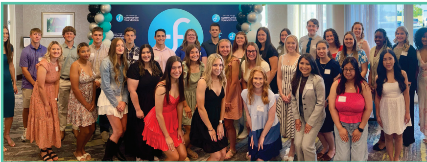
GSCF Scholarship Recipients